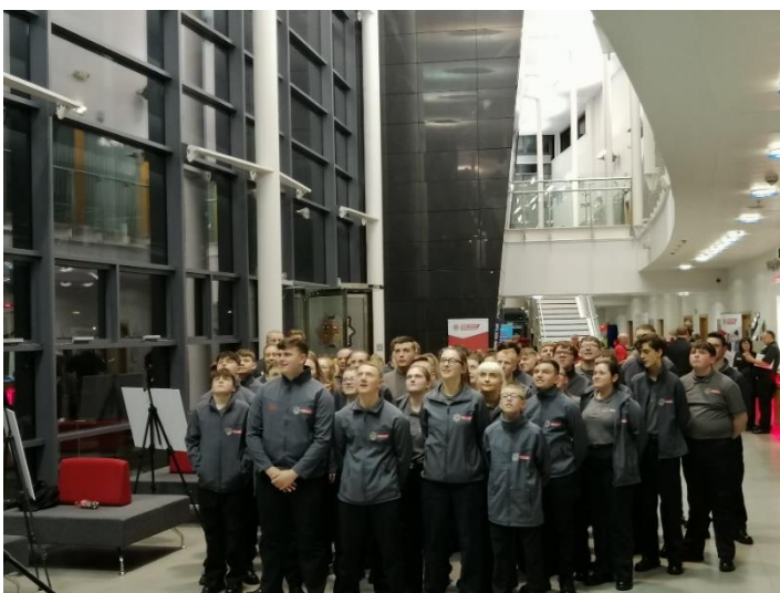
Members of the Youth Volunteer Scheme based at Dumbarton Community Fire Station during the launch at National Training Centre Cambuslang.