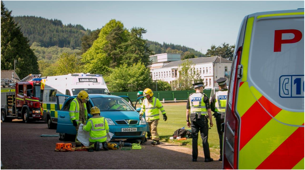
West Dunbartonshire Crews in multi-agency training exercise with Partners