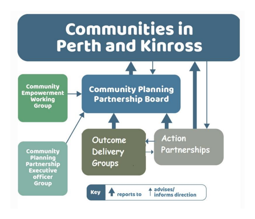
Diagram One – Shared Approach for Improving Local Outcomes in Perth & Kinross

As a statutory partner of the Perth & Kinross CPP, we will fully contribute towards improving the local outcomes in the Perth & Kinross Community Plan (LOIP) and help take forward the priorities in the locality action plans. Our work towards supporting this, sits within the context of the Perth & Kinross Local Fire and Rescue Plan, and along with other partner plans and strategies, the shared approach for improving local outcomes is illustrated in Diagram one below.